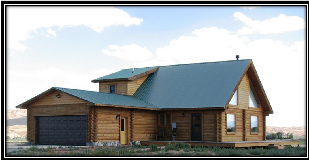
Heart Mountain Log Home